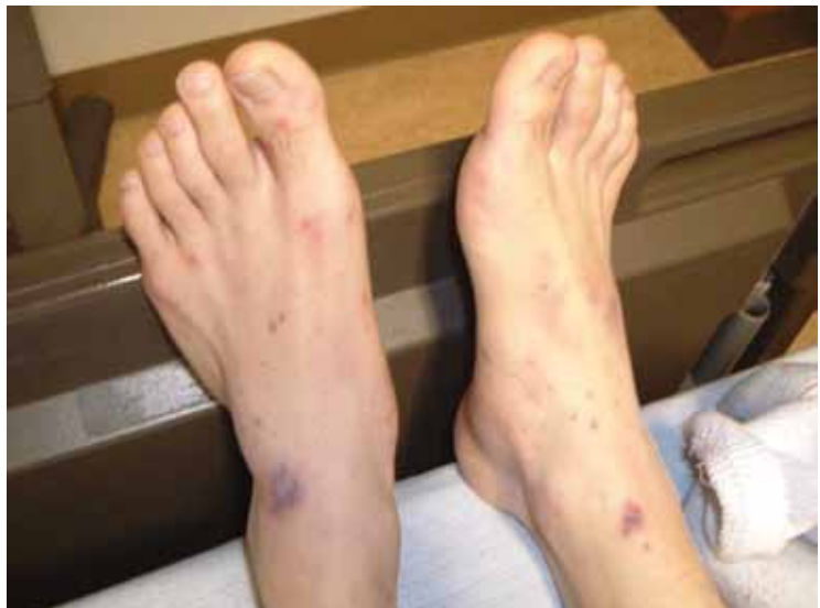
FIGURE 1. Petechial rash from Neisseria meningitidis .