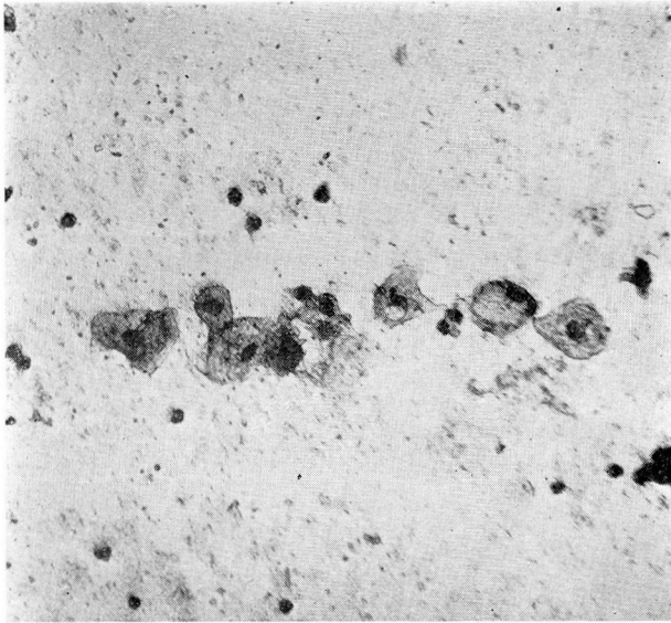
FIGURE 1: Vaginal smear from surgical castrate, untreated. (X225)

jective benefit within three days after beginning stilbestrol therapy and obtain a maximum effect from a given dose within ten to fourteen days.