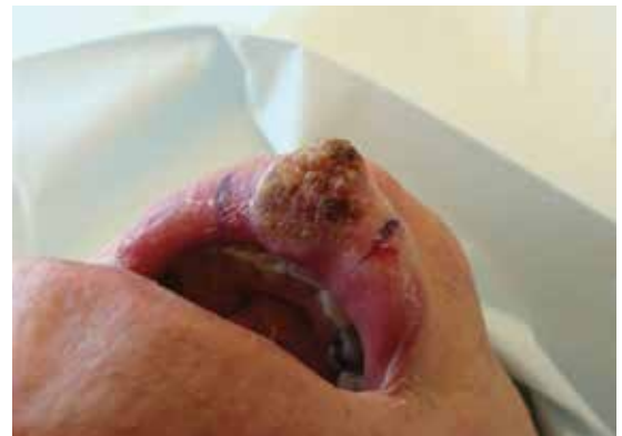
FIGURE 1. The lesion was crusted and indurated. The view on the right shows the markings for the planned surgical removal.

The patient chose Mohs surgery, which resulted in excellent cosmetic and functional outcome