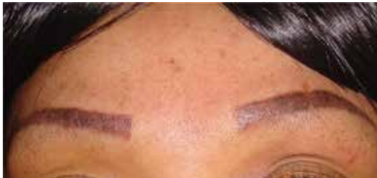
FIGURE 4. After treatment.

an elevated serum angiotensin-converting enzyme level, but this finding alone is not sensi-