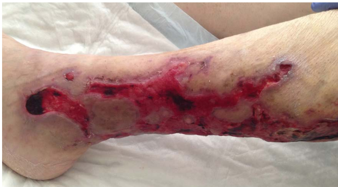
FIGURE 1. The patient's left lower leg had a star-shaped ulceration that included large areas of granulation tissue and necrotic tissue.

A 64-YEAR-OLD MAN WAS admitted for extensive painful ulceration of the left lower leg ( Figure 1 ) that occurred after a fall and that had worsened over the last 4 months.