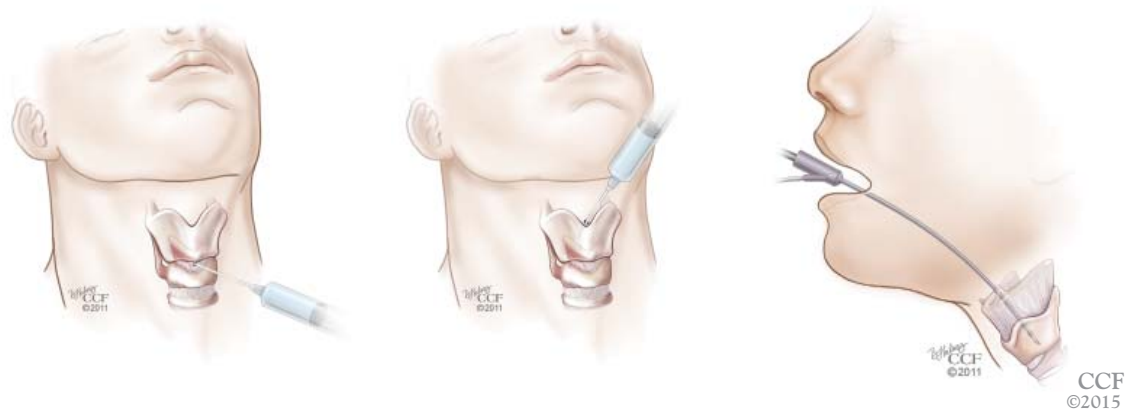
FIGURE 1. In the treatment of adductor spasmodic dysphonia, botulinum toxin is injected into the thyroarytenoid muscle via the cricothyroid membrane (left), the most common approach, as well as through the thyrohyoid membrane (middle) and through the mouth (right).

diseases and neurodegenerative disorders, or tardive syndromes. 1 Because of the relationship with other neurologic diseases, consultation with a neurologist should be considered.