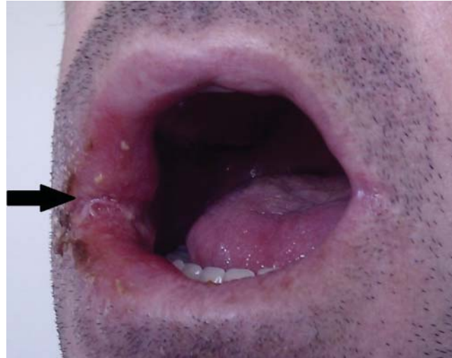
FIGURE 1. The patient presented with a solitary ulcerated lesion with an infiltrated base and irregular, indurated, rolled borders (arrow).

Chest radiography showed pulmonary infiltrates in both bases and the upper right lobe and cavitation in the upper left lobe. Thoracic computed tomography confirmed the presence of multiple cavitated lesions in both left and right lung fields. Sputum cultures were positive for Mycobacterium tuberculosis , an organism sensitive to several agents. Laboratory investigations that included blood cell counts, biochemical tests, and liver and kidney function tests were normal, with the exception of a low lymphocyte count.