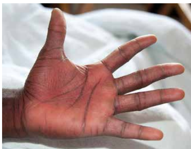
FIGURE 2. The patient had confluent erythema with petechiae on the palms.

standard vaccines including a tetanus booster were up to date.