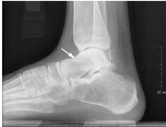
FIGURE 1. A radiograph of the right ankle at the time of presentation shows evidence of talar dome collapse (arrow) due to avascular necrosis of the talus body.

Radiography of the ankle (Figure 1) shows a subtle lucency in the talar dome with minimal subarticular collapse seen on the lateral view, suggestive of avascular necrosis and diffuse osteopenia. Joint spaces are maintained.