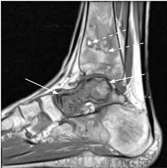
FIGURE 3. On sagittal T1-weighted magnetic resonance imaging, the serpentine black line indicates avascular necrosis in the talar head, neck, and body (solid arrows). Found incidentally were smaller foci of avascular necrosis in the distal tibial metaphysis and epiphysis (dashed arrows).