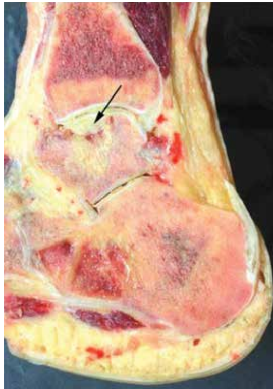
FIGURE 4. A sagittal section after amputation shows the collapsed dome of the talus and bone necrosis (arrow.)

These drugs are extremely expensive. Currently, the estimated cost of therapy for 1 year would be $432,978 for imiglucerase, $324,870 for taliglucerase alfa, and $368,550 for velaglucerase alfa. (The estimated costs are for 1 year of treatment for a 70-kg patient at 60 U/kg every 2 weeks.) 18 Taliglucerase alfa is less