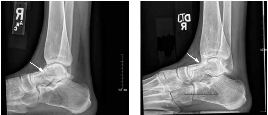
FIGURE 2. Radiographs after 4 months of conservative therapy (left) and just before below-the-knee amputation (right), when viewed along with Figure 1 , show progressive talar dome collapse due to avascular necrosis of the talus body.