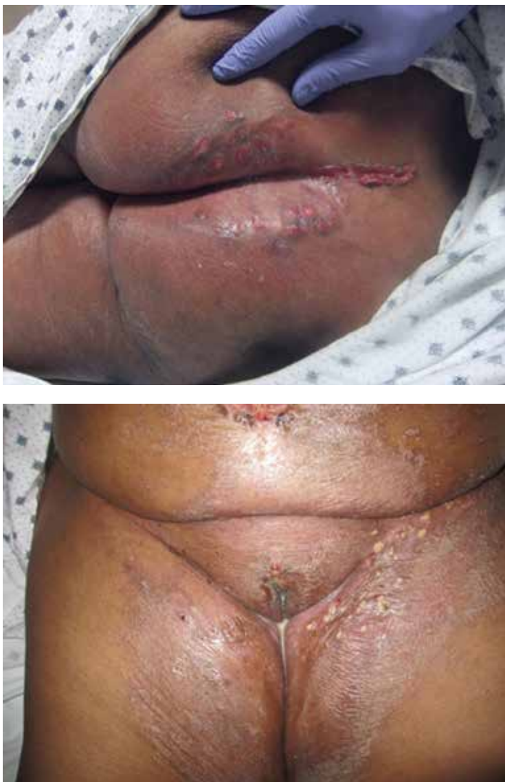
FIGURE 6. A 62-year-old woman with a long history of skin ulcerations with polymicrobial infections presented with generalized xerosis and red painful erosions in intertriginous areas, the result of vitamin B 6 deficiency.

erosions in intertriginous areas ( Figure 6 ).