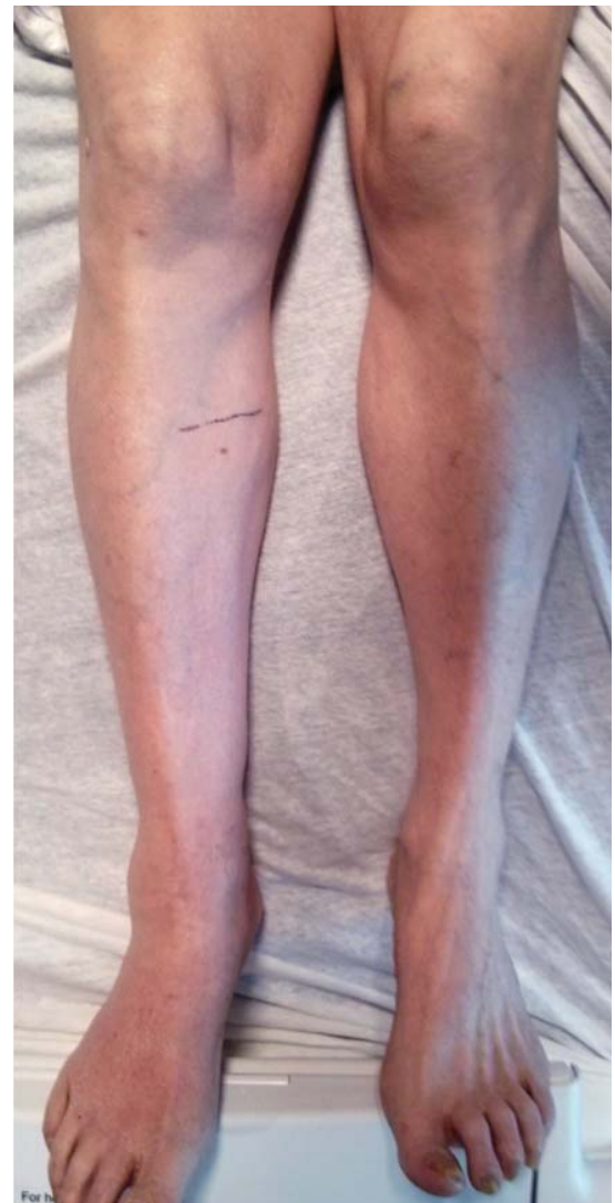
FIGURE 3. After pharmacomechanical thrombectomy and placement of an iliac vein stent, the skin color returned to normal and the swelling resolved.

The differential diagnosis includes infection (cellulitis, necrotizing fasciitis), compartment syndrome from limb injury, musculoskeletal conditions such as ruptured Baker cyst, venous stasis due to external compression (May-Thurner syndrome, iliac vein compression syndrome, pelvic tumor), acute limb ischemia from arterial obstruction, and complex regional pain syndrome (reflex sympathetic dystrophy).