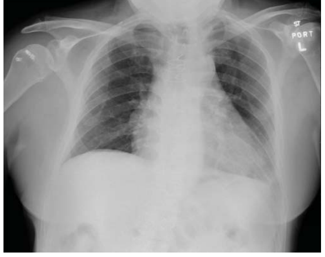
FIGURE 2. A follow-up chest radiograph confirmed resolution of the elevated right hemidiaphragm.

He was admitted to the hospital for observation, and over the course of 8 to 12 hours his shortness of breath resolved, and his findings on lung examination normalized. Repeat chest radiography 24 hours after his emergency room presentation showed regular positioning of his diaphragm ( Figure 2 ).