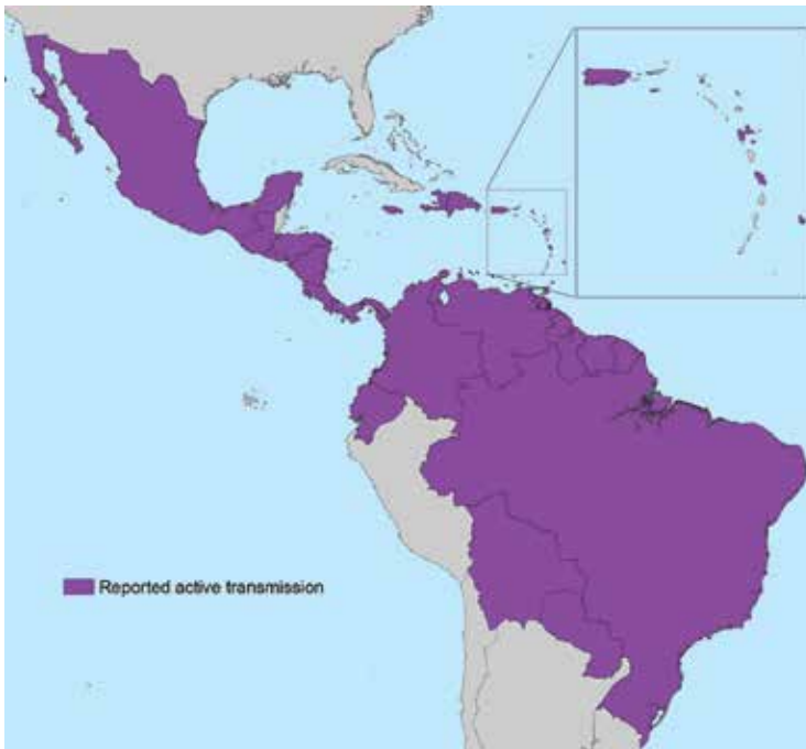
FIGURE 1. Reported transmission of Zika virus in the Americas.

From US Centers for Disease Control and Prevention. www.cdc.gov/zika/geo/americas.html