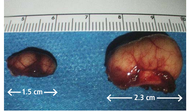
FIGURE 2. The cysts after successful endoscopic resection.

A 50-YEAR-OLD MAN PRESENTED to the otolaryngology clinic, complaining of throat discomfort for the past 3 months that worsened in the supine position. The clinical examination revealed one cystic lesion on either side of the epiglottis (Figure 1). The larger cyst measured 23 \times 13 \times 12 mm. The man's symptoms resolved completely after endoscopic removal of the cysts under general anesthesia (Figure 2).