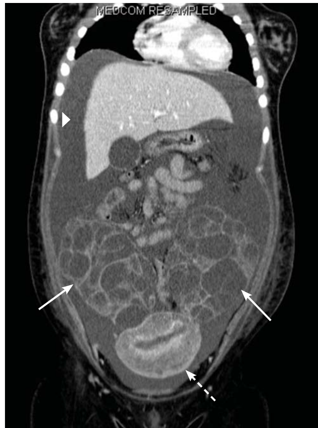
FIGURE 2. Coronal view of computed tomography of the abdomen and pelvis with contrast enhancement showed significant ascites (arrowhead) and enlargement of both ovaries with multiple cysts (arrows). The uterus (dashed arrow) also appears heterogeneous and edematous with fluid in the endometrium.

Mild OHSS can be treated on an outpatient basis with bed rest, oral analgesics, limited oral intake, and avoidance of vaginal intercourse, and usually resolves in 10 to 14