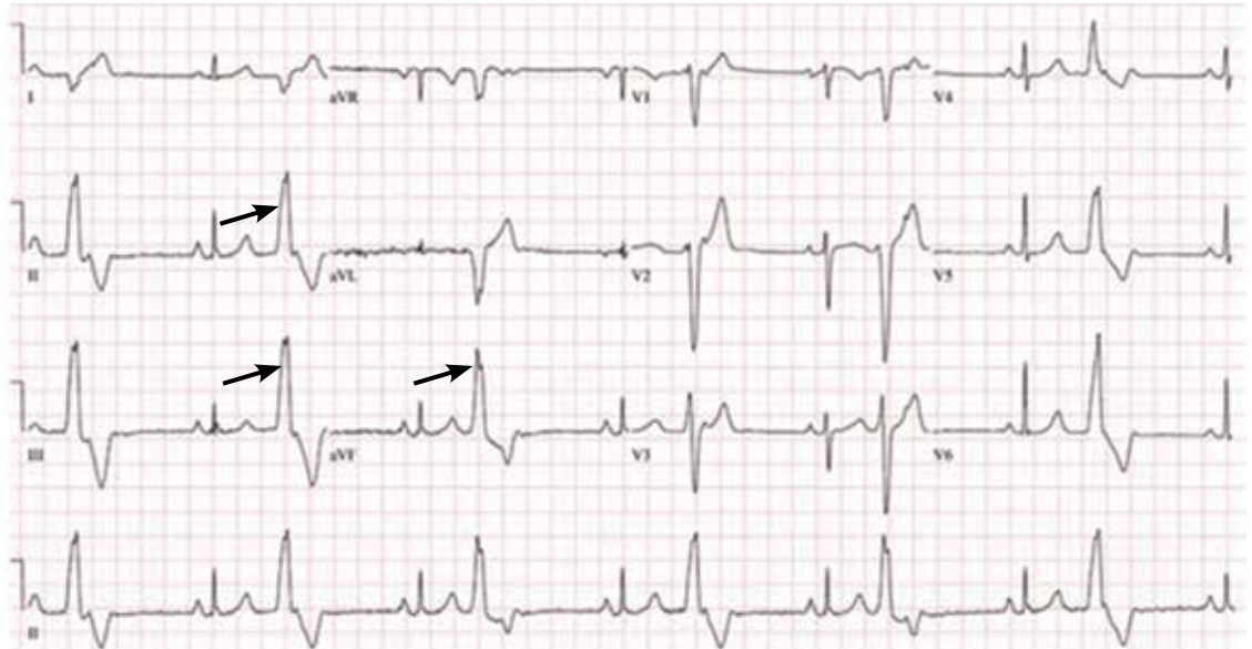
FIGURE 2. Typical configuration of right outflow tract premature ventricular complexes (PVCs) in the 12-lead electrocardiogram. The PVCs exhibit a tall R wave in the inferior leads (arrows) and a left bundle-branch block pattern.

arise from both the tricuspid and mitral valve annuli, the left ventricular fascicles, or from the epicardium.