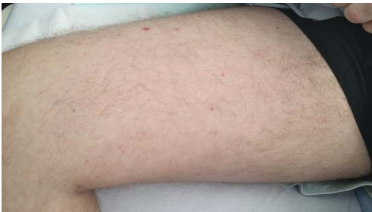
FIGURE 1. At presentation, the patient had a sparse, erythematous, macular, nonblanching rash on the lower and upper limbs.

The patient had been taking a TNF-alpha inhibitor and had recently returned from Mexico