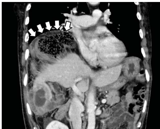
Figure 2. The Chilaiditi sign on computed tomography, with volvulus of the cecum between the diaphragm and liver and a closed-loop obstruction (arrows).

In the article “Gas under the right diaphragm” (Matsuura H, Hata H. Cleve Clin J Med 2018; 85[2]:98–100), Figure 2 appeared upside down. It should have appeared as follows: