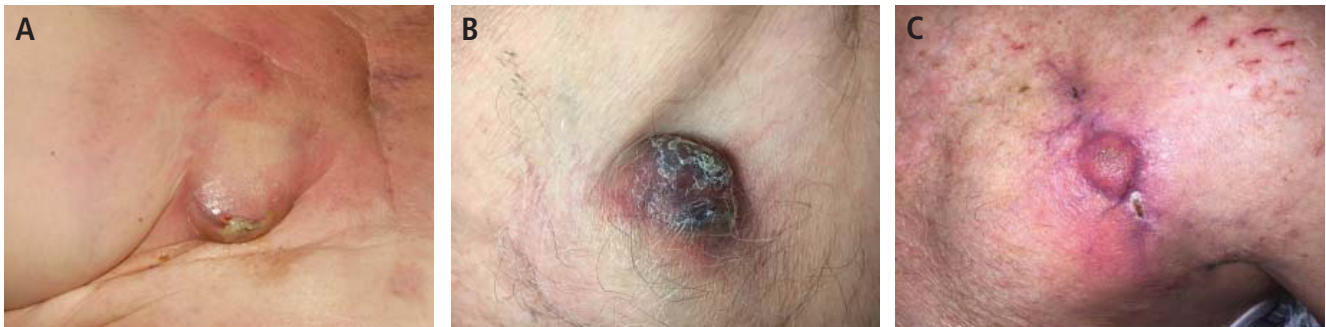
Figure 1. Pocket infection after placement of a cardiac implantable electronic device can present as erythema and drainage (A); swelling, skin necrosis, and eschar formation (B); and erythema, swelling, and bullae formation (C).

comorbidities including diabetes, renal failure, prior heart valve operation, rheumatic heart disease, and prior bloodstream infection. 2 Despite the theoretical divide in CIED infections (endovascular vs pocket), overlap is common: many patients with pocket infection show evidence of bacteremia and vegetations on the leads.