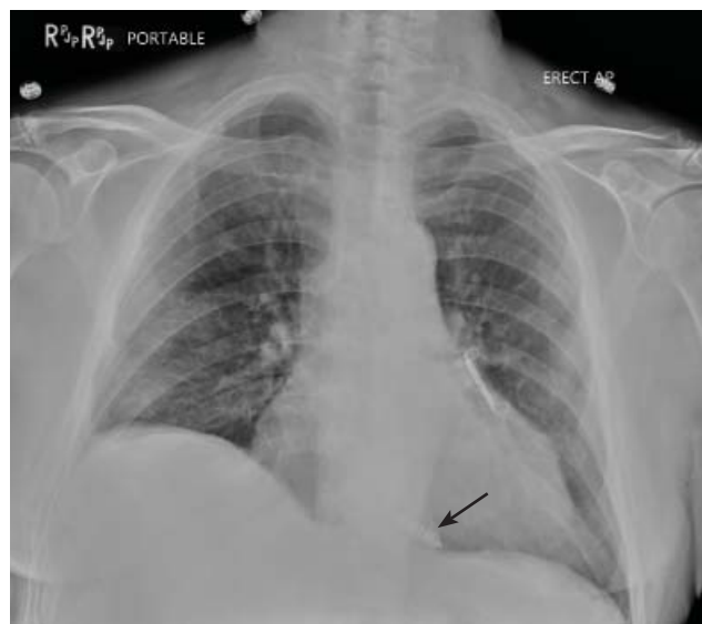
Figure 4. A leadless pacemaker in the right ventricle. The left atrial appendage exclusion clip is present.

hemodialysis). 50 On the other hand, the leadless pacemaker is a single-chamber pacemaker deployed percutaneously in the right ventricle without the need for a pocket, thereby eliminating the risk of pocket infection (Figure 4). 51,52 Whether the risk of endovascular infection will be reduced is not yet known.