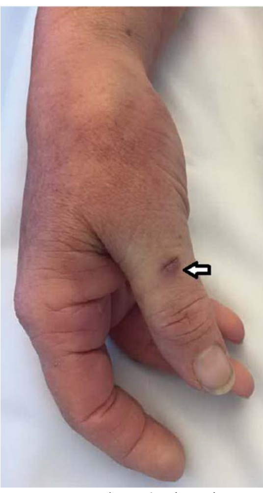
FIGURE 1. A 1-cm laceration (arrow) on patient's right thumb from a dog bite 2 days before presentation.

A PREVIOUSLY HEALTHY 59-year-old woman with a remote history of splenectomy following a motor vehicle accident presented to the emergency department with a chief complaint of fever. She had been in her usual