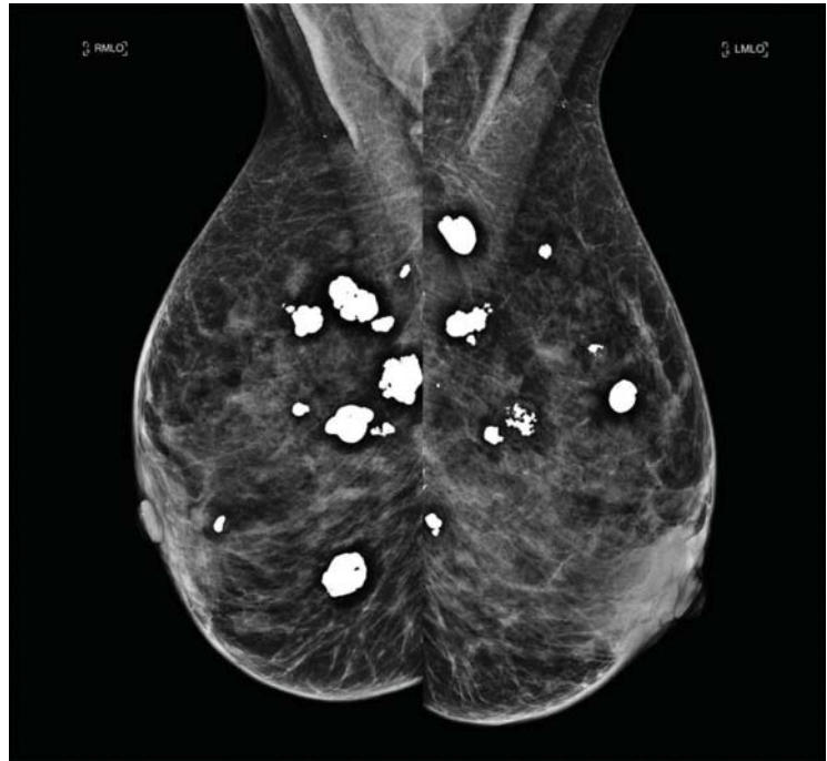
FIGURE 2. Mammography confirmed the presence of lesions in both breasts.

pathological study. Br J Radiol 1976; 49:12–26.