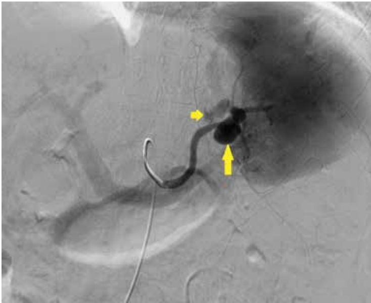
FIGURE 2. Angiography before treatment demonstrates splenic aneurysm (large arrow) with extravasation (small arrow).

Although splenic artery aneurysm rupture is rare, it has a high mortality rate and warrants a high index of suspicion