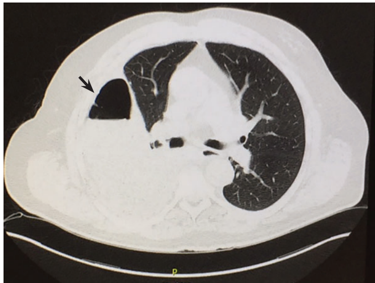
Figure 1. Computed tomography shows a wedge-shaped area of low attenuation suggesting a focal infarction in the collapsed and consolidated right lower lobe.

Blood in the pleural fluid does not necessitate withholding anticoagulation unless the bleeding is heavy. A pleural fluid hematocrit greater than 50% of the peripheral blood hematocrit suggests hemothorax and is an indication to withhold anticoagulation. 1 Our patient's pleural fluid was qualitatively san-