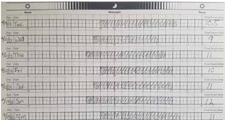
Figure 2. Sleep log from the patient in Figure 1 shows relatively good concordance between perceived sleep schedule and actual sleep schedule.