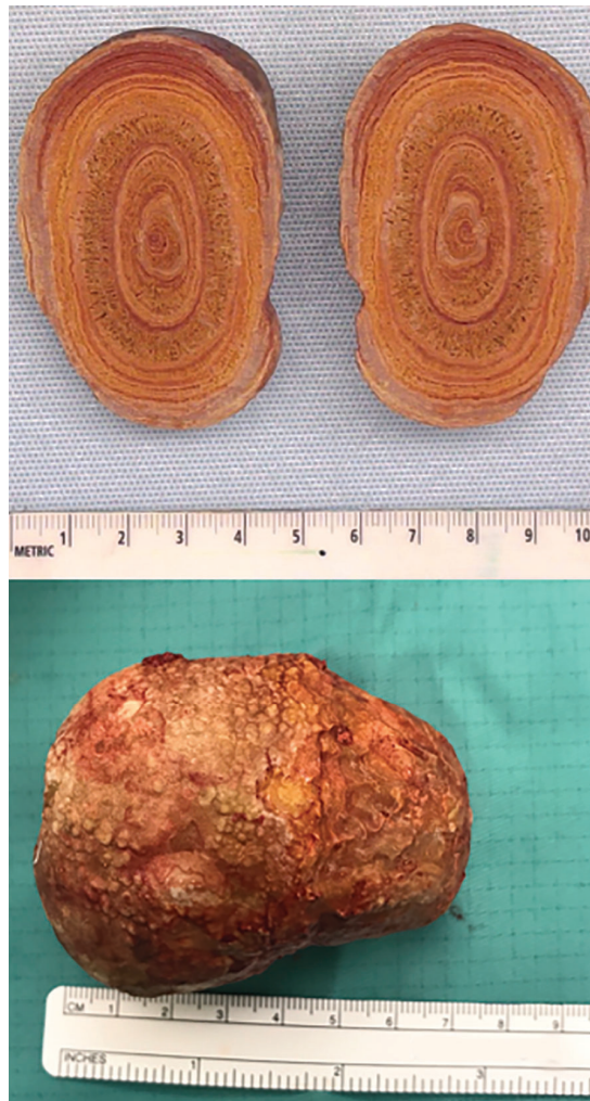
Figure 2. The bladder stone measured 6.9 cm × 4.8 cm × 4.5 cm.

Bladder calculi account for only 5% of all urinary stones; they often arise in the setting of bladder outlet obstruction and are rarely associated with upper tract calculi. 1,4 The earliest giant bladder stone was found in the skeleton of a 7,000 year-old Egyptian mummy, and the prevalence of these stones has dramatically decreased in the developed world due to modernization of diets. 1 No specific nutritional deficiency has been causally linked to bladder stone formation, though these calculi remain most common in North Africa, the Middle East, and India in chronically undernourished children with diets