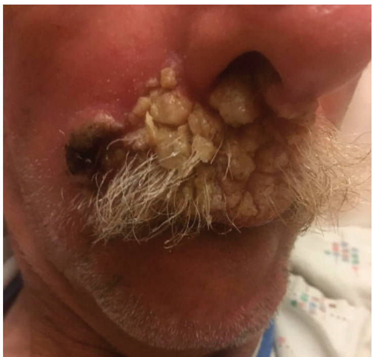
Figure 1. The patient presented with exophytic verrucous plaques on his upper cutaneous lip and nose.

Magnetic resonance imaging of the brain revealed ring-enhancing lesions in the pons and inferior cerebellar peduncle. Computed tomography of the chest showed bilateral upper-