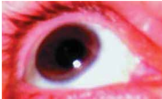
Figure 3. Corneal arcus.

A study from Denmark showed an adjusted odds ratio for coronary artery disease of 3.3 in carriers of a familial hypercholesterolemia mutation. 21 Similarly, the Spanish Familial Hypercholesterolemia Longitudinal Cohort Study (SAFEHEART) found the prevalence of atherosclerotic cardiovascular disease to be 3 times higher in people with familial hyper-