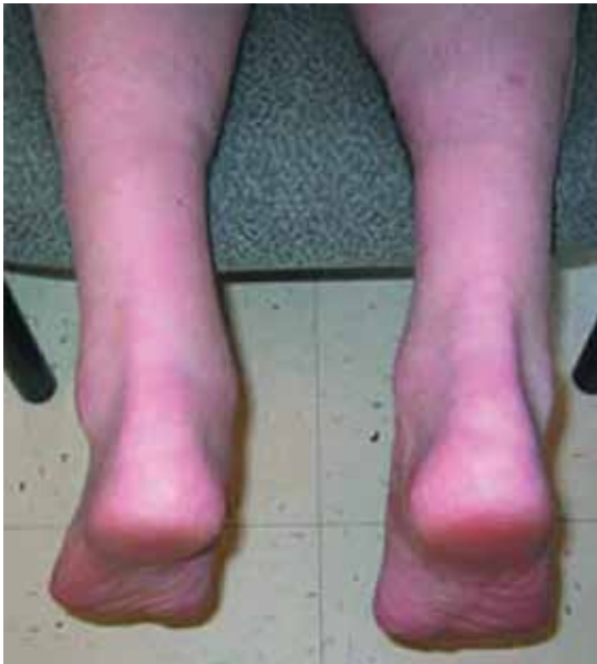
Figure 2. Xanthomas of the Achilles tendons. Note the position used for examination, with the patient kneeling on a chair.