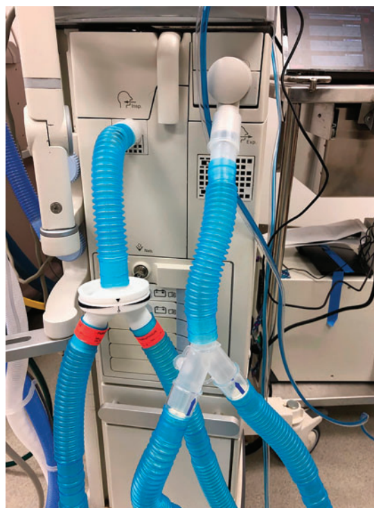
Figure 1. Inspiratory and expiratory inputs to ventilator, with Y connectors.