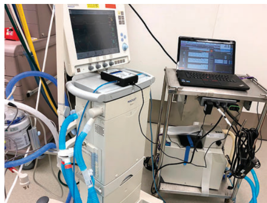
Figure 2. Ventilator setup with volume monitor.

With more patients than machines, multiplex ventilation is a reasonable last resort to prevent certain death