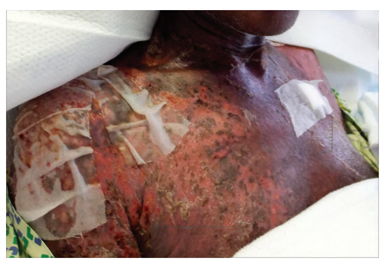
Figure 5. Toxic epidermal necrolysis in a patient receiving pembrolizumab for Sézary syndrome.