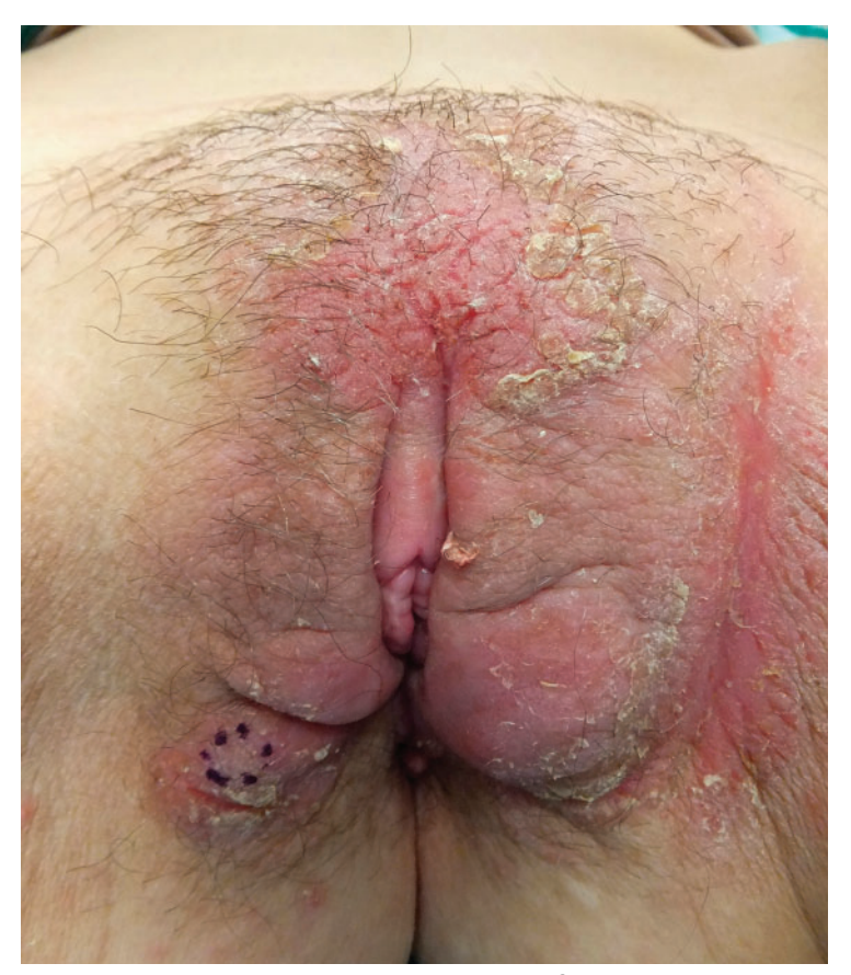
Figure 2. Inverse psoriasis induced by infliximab treatment for Crohn disease.