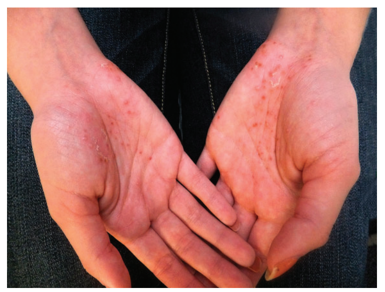
Figure 1. Palmar psoriasis eruption in a patient receiving infliximab treatment for Crohn disease.

Another study<sup>10</sup> examined 102 patients with TNF alpha inhibitor-induced psoriasis and found the most common forms to be plaque-type (49.5%) and scalp (47.5%). Palmoplantar pustulosis (whose differential diagnosis can include dyshidrotic eczema, contact dermatitis, pityriasis rubra pilaris, acquired palmoplantar keratoderma, tinea pedis, and tinea manuum) was also found in 41% of these patients. Topical medications alone improved the eruption in 63.5% of patients, with cyclosporine and methotrexate often successful when topical treatments alone failed.<sup>10</sup> Discontinuation of