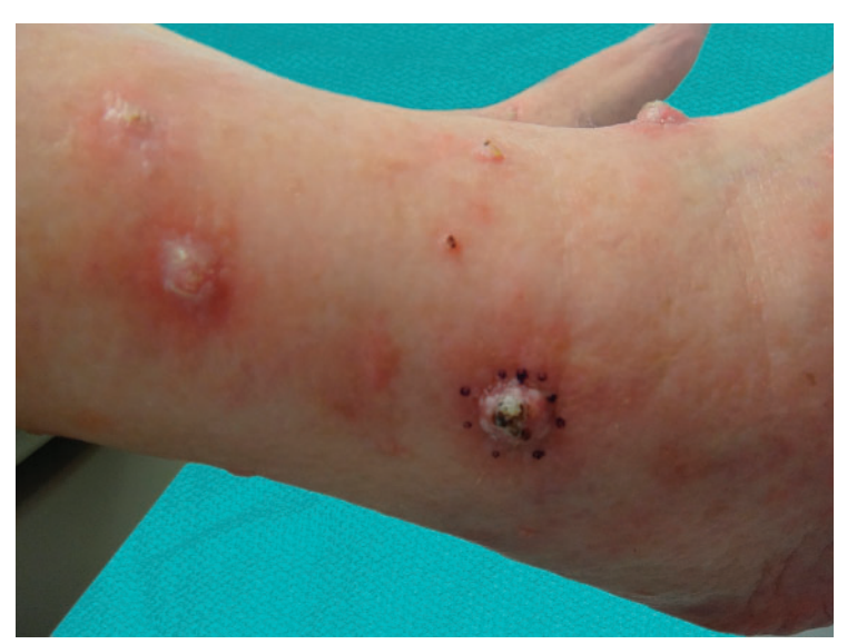
Figure 4. Eruptive squamous cell carcinoma keratoacanthomas in a patient receiving ruxolitinib for primary myelofibrosis.

on the drug, can be employed in these cases.