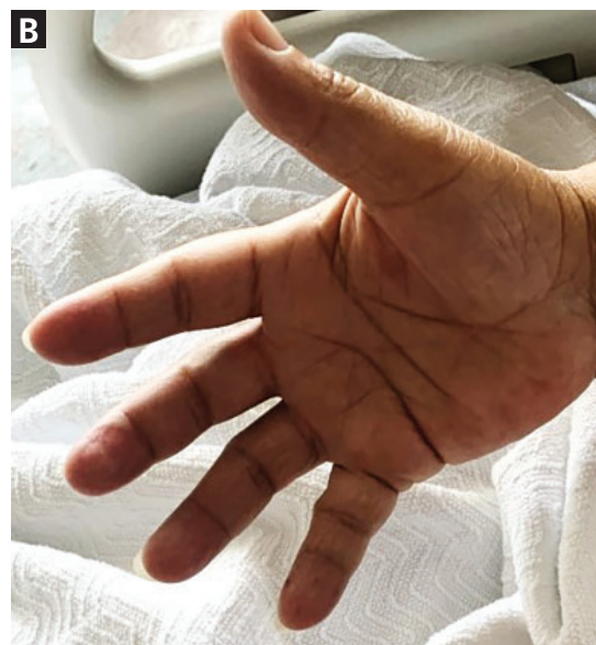
Figure 2. Note the violaceous nailbed of the second digit (onychomelanosis) (A), with patchy erythema prominent over the hypothenar eminence (B).

terruption, interval lengthening, and dose reduction. ■