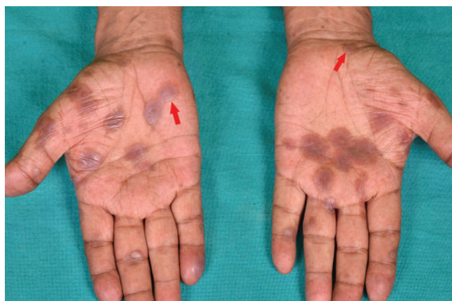
Figure 1. Well-defined dusky, discoid patches and plaques with peripheral collarette of scales (red arrows) on the palms.