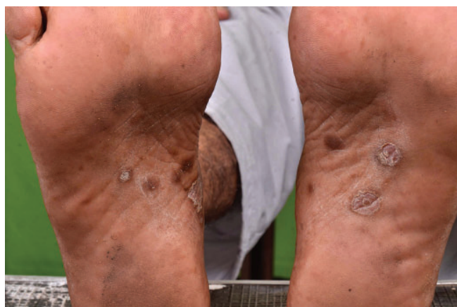
Figure 2. Well-defined dusky, discoid plaques with peripheral desquamative scaling on the instep of the patient's soles. Some of the lesions appear psoriasiform.

A 51-YEAR-OLD MAN presented with a 3-month history of reddish-brown lesions on his body and scaly brown lesions on the palms and soles and a 1-month history of mildly painful oral erosions. He had also noticed a buzzing sound in the right ear for the past 20 days.