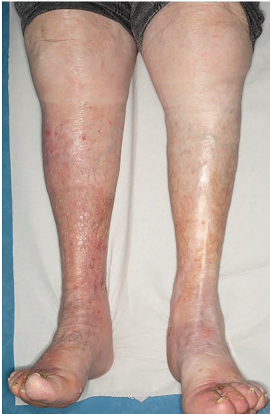
Figure 1. Venous eczema associated with chronic venous insufficiency of the lower limbs. The condition is worse on the right leg.

interventions are effective and safe treatments for superficial venous incompetence, mainstay management for CVOO until recently has been limited to compression therapy and supportive measures such as lifestyle changes. These nonsurgical measures are often unsatisfactory to patients as well as clinicians. Open deep venous reconstructive surgery also has limitations: it is invasive, evidence is insufficient to support the benefits, and its use is limited to a very select group of patients and surgeons. 6 Endovascular intervention is a promising option.