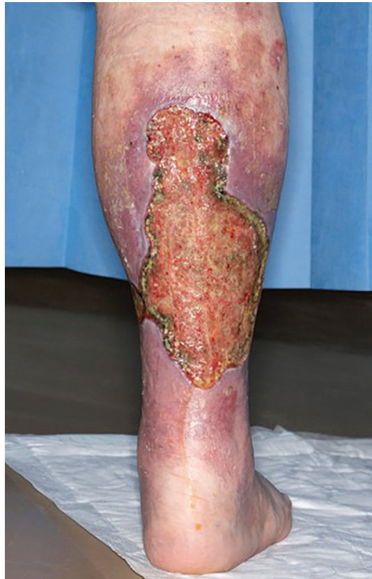
Figure 2. Severe venous ulceration associated with chronic venous insufficiency. Venous ulceration typically occurs in the ankle (gaiter) with surrounding skin changes such as venous eczema (purplish discoloration around the ulcer) and lipodermatosclerosis as well as edema. No clinical feature of the ulcer indicates that chronic venous outflow obstruction (CVOO) is the cause, but the severity of the disease is often worse with CVOO than with superficial venous incompetence, although not exclusive.

The definition of CVD is wide-ranging and patient-specific, often characterized by manifestations of chronic venous hypertension. Symptoms and signs include varicose veins, telangiectasias, pain and discomfort, cramps, restless legs, itching, heaviness, and edema. Skin changes can include venous eczema,