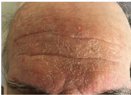
Figure 1. The rash at presentation.