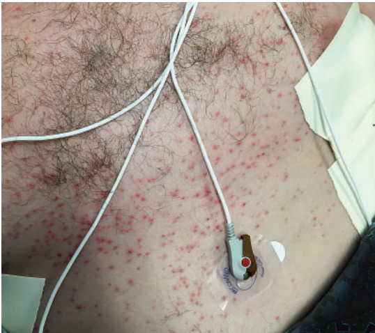
Figure 3. Vesicular eruption in COVID-19. A 52-year-old man developed a vesicopustular eruption on his trunk during hospitalization for COVID-19 requiring intensive care unit admission and mechanical ventilation for acute respiratory failure due to respiratory distress syndrome. He recovered and was eventually discharged.

guide early testing (Figure 2). 13 Additionally, an analysis of 200 patients with COVID-19 with cutaneous manifestations 14 found a significant association between urticaria and gastrointestinal symptoms, which could assist clinicians in their anticipatory management.