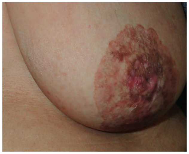
Figure 1. Brownish erythematous patch in the nipple-areola complex.

A N 85-YEAR-OLD WOMAN presented with a 9-month history of pruritus in the left breast and unremarkable medical history. On examination, a brownish erythematous patch was observed in the nipple-areola complex (Figure 1).