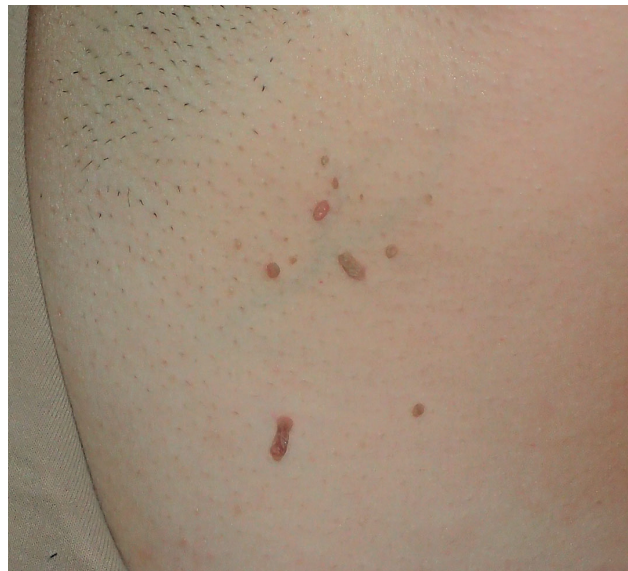
Figure 2. Acrochordons on the axillae.

Computed tomography showed no evidence of lung cysts or kidney tumor. Regular cancer surveillance was instituted.