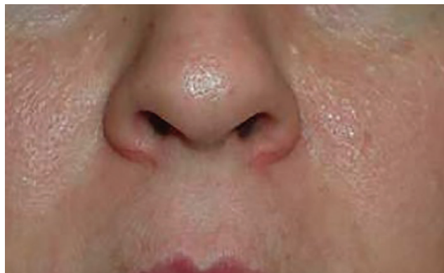
Figure 1. Multiple whitish to skin-colored papules on both cheeks.

A 43-YEAR-OLD WOMAN PRESENTED to the dermatology department with multiple small skin-colored papules on her cheeks ( Figure 1 ) and acrochordons (“skin tags”) on the axillae ( Figure 2 ). She reported that they had appeared over the past few years. Her personal medical history was unremarkable, but she had a first-degree relative with renal carcinoma.