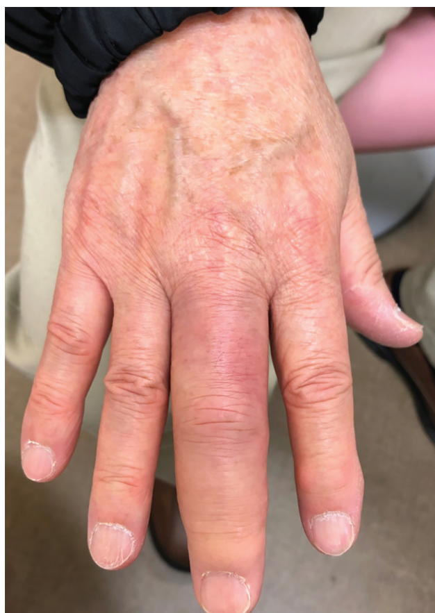
Figure 1. At presentation, the patient’s right middle finger was swollen, with a sausage-like appearance.

Histology revealed exudative synovitis with lym-