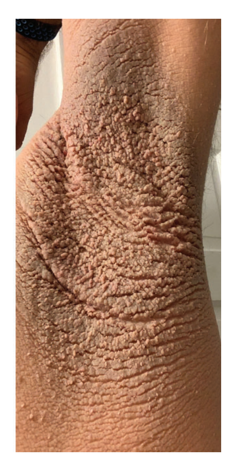
Figure 2. Severe disease progression after 2 years.

Common causes of acanthosis nigricans include obesity, medications, and endocrine abnormalities, with rarer cases due to paraneoplastic phenomenon or a familial trait via germline fibroblast growth factor receptor 3 mutations.<sup>2–4</sup> Obesity-associated acanthosis nigricans can present together with insulin resistance, high body mass index, diabetes, metabolic syndrome, or polycystic ovarian syndrome. Medications associated with acanthosis nigricans include nicotinic acid (niacin), oral corticosteroids, oral contraceptives, methyltestosterone.<sup>2</sup> The paraneoplastic form is most often seen with gastric adenocarcinoma, though other causes have also been identified.<sup>2</sup>