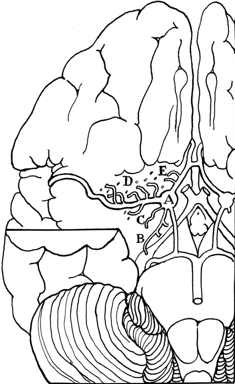
FIGURE 1. Scheme showing the position of the arterioles which supply the basal ganglia and the internal capsule (after Alexander). A—internal carotid artery, B—anterior choroidal artery, C—capsular artery arising directly from the internal carotid, D—striate arterioles from the middle cerebral artery, E—striate arterioles from the anterior cerebral artery. All the striate arterioles enter the brain through the anterior perforated substance.