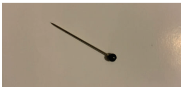
Figure 1. Example of a tailor's pin.

without guarding or rebound tenderness, and exhibited positive bowel sounds.