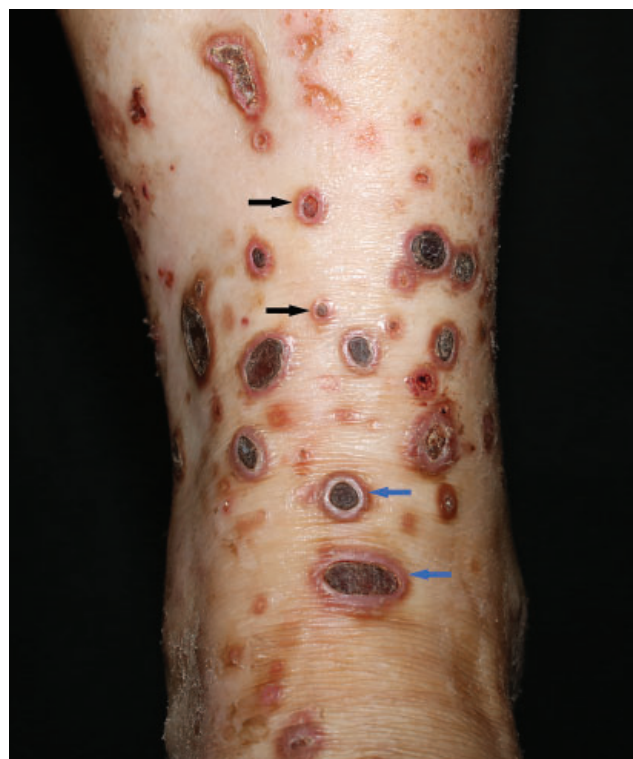
Figure 1. Multiple umbilicated hyperkeratotic papules (black arrows) and nodules (blue arrows) with a central round crusted ulcer on the left ankle.

A 47-YEAR-OLD WOMAN presented with a 2-month history of pruritic eruptions on the left ankle and a complaint of thirst and polyuria for the past year. She was previously healthy and denied a history of insect bites.