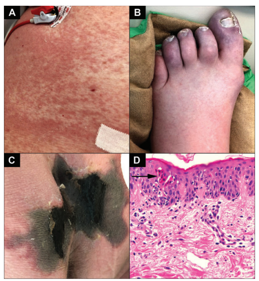
Figure 1. Cutaneous abnormalities on a 68-year-old critically ill man with COVID-19 including a morbilliform rash on the abdomen (A) , acral purpura (B) , and plaque-like cutaneous purpura and necrosis with livedoid borders (C) . A biopsy from the abdomen (D) shows groups of apoptotic keratinocytes in the epidermis (arrow), suggestive of a viral exanthem.

At Cleveland Clinic, patients we have seen with cutaneous eruptions while suffering from COVID-19 have had cutaneous morphologies that align with those reported above. Importantly, an individual patient may present with multiple simultaneous cutaneous abnormalities that differ in morphology. Recently, we treated a 68-year-old critically ill man with COVID-19 who had a morbilliform rash on his trunk (Figure 1A), acral purpura reminiscent of perniosis (Figure 1B), and an ulcerated, purpuric plaque with retiform/