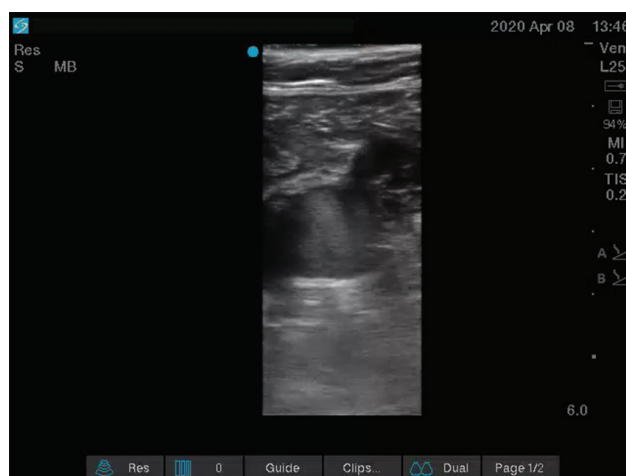
Figure 2. Another short-axis view of the femoral vein (center) and the femoral artery (bottom right) at the site of the saphenous vein inflow (top right). Swirling pattern of high echogenicity suggests low-flow state.