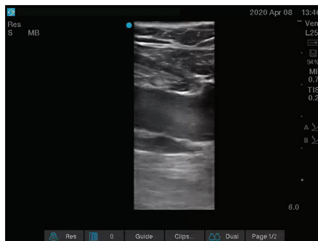
Figure 3. Long-axis view of the femoral vein, with spontaneous echogenicity and slow flow.