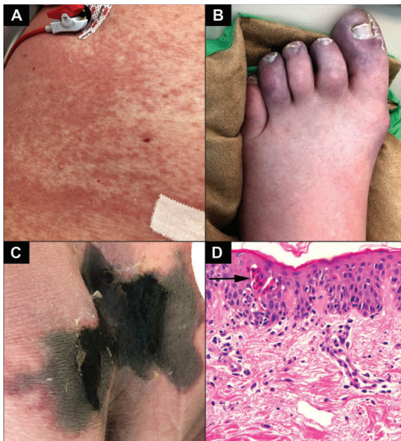
Figure 1. Cutaneous abnormalities on a 68-year-old critically ill man with COVID-19 including a morbilliform rash on the abdomen ( A ), acral purpura ( B ), and plaque-like cutaneous purpura and necrosis with livedoid borders ( C ). A biopsy from the abdomen ( D ) shows groups of apoptotic keratinocytes in the epidermis (arrow), suggestive of a viral exanthem.

At Cleveland Clinic, patients we have seen with cutaneous eruptions while suffering from COVID-19 have had cutaneous morphologies that align with those reported above. Importantly, an individual patient may present with multiple simultaneous cutaneous abnormalities that differ in morphology. Recently, we treated a 68-year-old critically ill man with COVID-19 who had a morbilliform rash on his trunk ( Figure 1A ), acral purpura reminiscent of perniosis ( Figure 1B ), and an ulcerated, purpuric plaque with retiform/